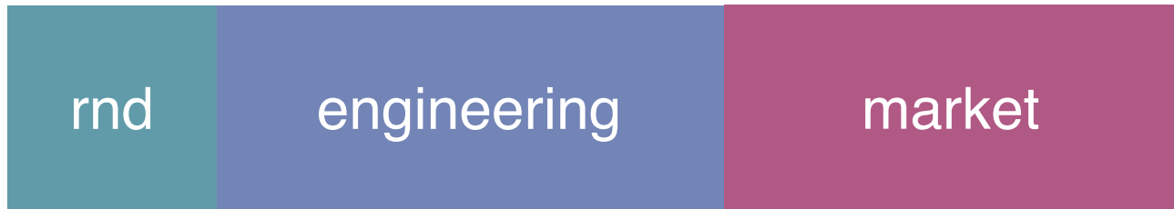
Figur 1. Buxton's image of the organisation for the engineering driven product development [4].

Boehm describes in his expose of just over a half-century of software engineering how the field evolved, mainly that we increasingly focusing on usability and value [1]. Software engineering has realised the problems with the top-down waterfall development model and introduced iterative models [10]. These models deal with changes in the problem space by development iterations. Each iteration in the spiral model or in the rational unified process (RUP) is basically a waterfall model. The foundation is still the technical rationality epistemology.