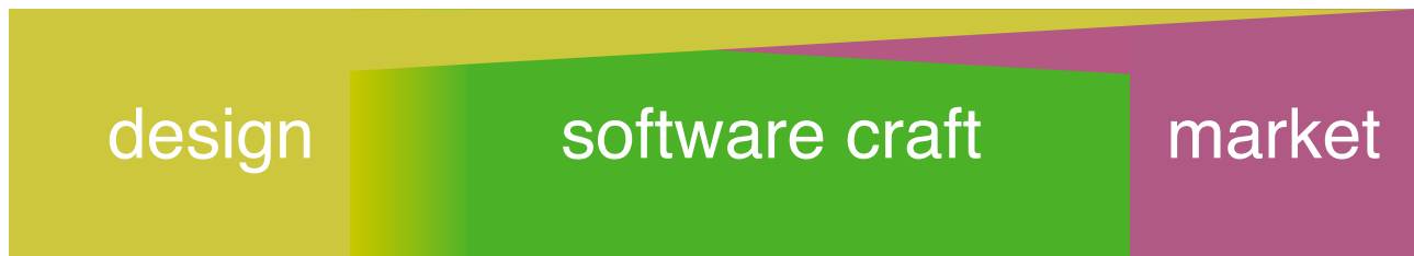
Figure 3. Design and Programming as a craft facilitates the transition in the design work's change of materials and technology – from paper to pixels from sketches to code.

The development of software - programming - is an activity with a wide range of intrinsic properties that are closer to craft than science or engineering. Sennett describes the Linux programmer as the modern craftsman [14].